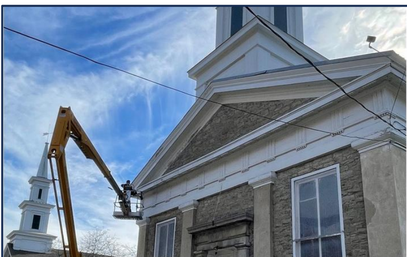
BUILDING REPAIRS - Our historic building got some much needed care - the metal roof and wood edges got a new coat of paint. Thank you to the property committee for doing their best to preserve our history and our future.